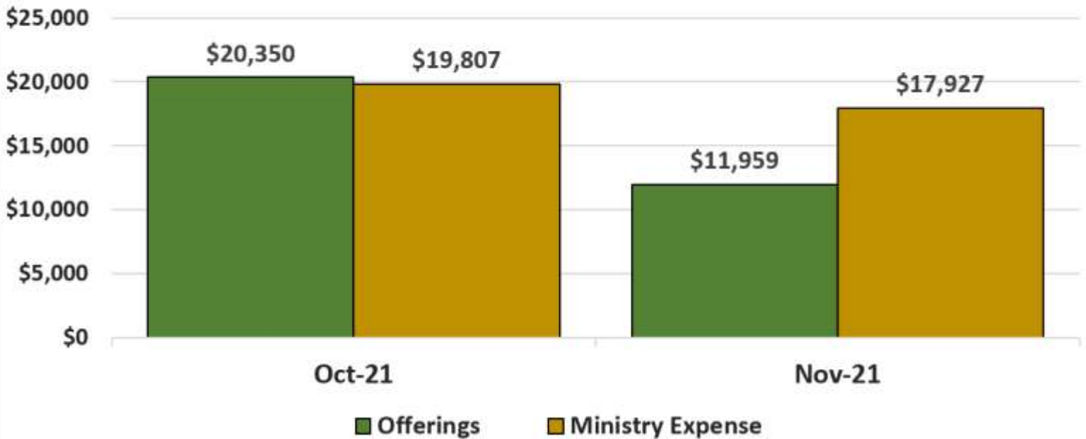
Offerings & Ministry Expenses by Month Fiscal YTD November, 2021